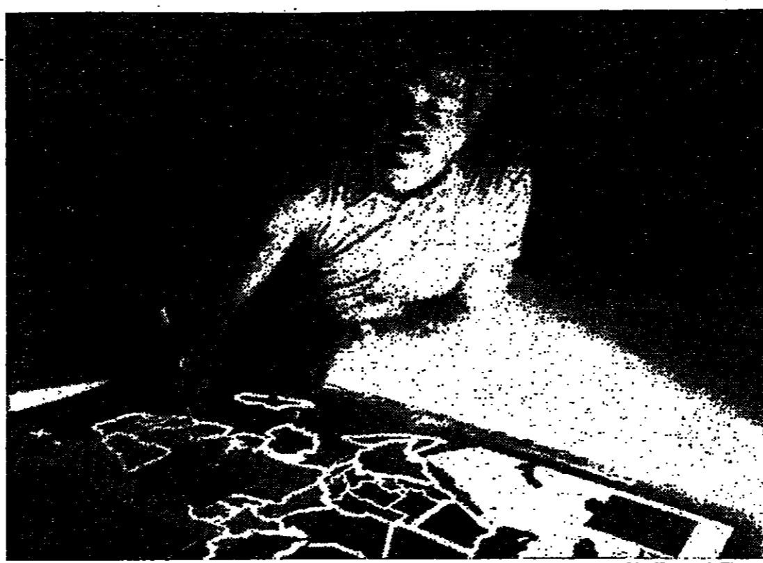
Map being prepared for an atlas in drafting room of Hammond Co.

WASHINGTON, Oct. 11 (UPI). —The Office of Education has reported that 40 percent of American children aged 3 to 5 are attending school this fall. Seven years ago only 25 percent of the 3-to-5-year-olds were in school. In the last school year, 4.1 million of the 10.9 million children in this age group were in school, the report said. This fall's estimate was based on expected increases over last year.